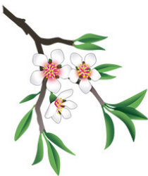
PINK BUD TO PETAL FALL