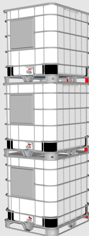
Required Warehouse Space - 48" x 40" x 138"