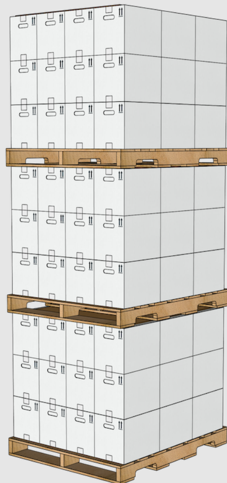
Required Warehouse Space - 48" x 40" x 150"