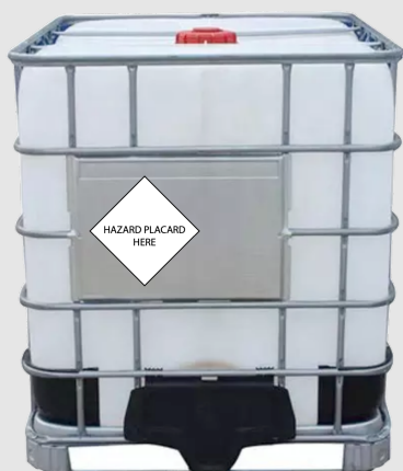
Unit Dimensions - 48" x 40" x 46"