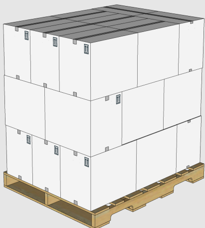
Full Pallet Dimensions - 48" x 40" x 51"