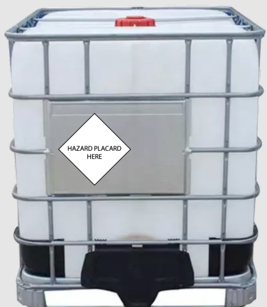
Full Pallet Dimensions - 48" x 40" x 46"